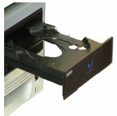
BluRay disk drive - a new recording solution for your Darlex

Download 25GB or 50GB of information onto one disk! The disks are tougher and more durable than DVD's and are therefore perfect for large data downloads and long archiving periods. This drive also supports all CD and DVD formats. BluRay could be the future of digital downloading and Tecton DVR's are the only recorders that support this format.