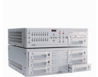
Darlex with extension box. All drives removable. V.5 firmware allows this unit to have disk sizes up to 1500GB per disk

This firmware supports disk sizes up to 1500GB. Five years ago 180GB was the largest disk size available. Larger disk capacity allows you to record for longer and archive images at a faster recording rate on each camera. This firmware also supports our unique disk quarantine feature. There are many other enhancements built into this firmware release. For further details please call the office.